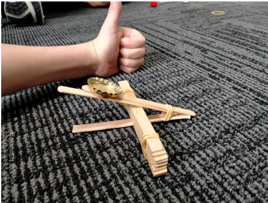
Figure 2. Students' later modifications were more successful. Two layer of icy pole sticks increased the strength and potential elastic energy of the lever.