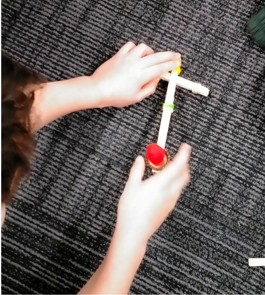
Figure 1 (b) An early modification to increase potential elastic energy to the lever – extended lever modification