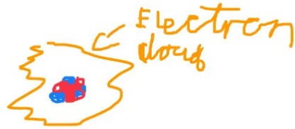
Figure 1(a) Student pre-evaluation drawing of an atom. Note their description of an electron cloud. Protons and neutrons in a distinct nucleus are also apparent.

electrons based on the electron cloud model. See Figures 1(a)(b) below. This apparent understanding aligns with the initial conversation I had with them to determine their level of understanding.