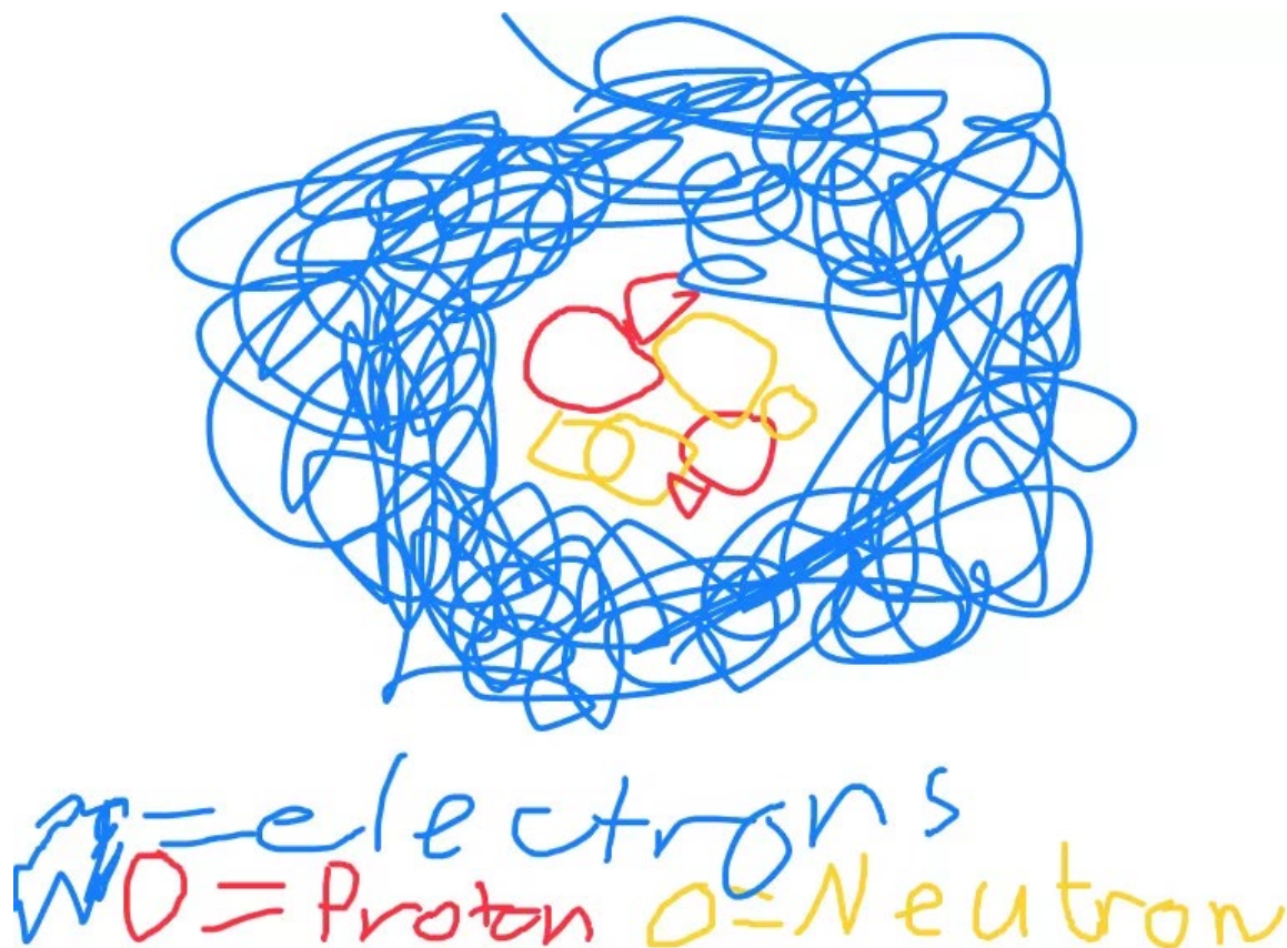
Figure 1(b) Pre-evaluation drawing from the second student (brother). Again, electrons are drawn in a cloud surrounding the nucleus as are the distinct nucleus with protons and neutrons.