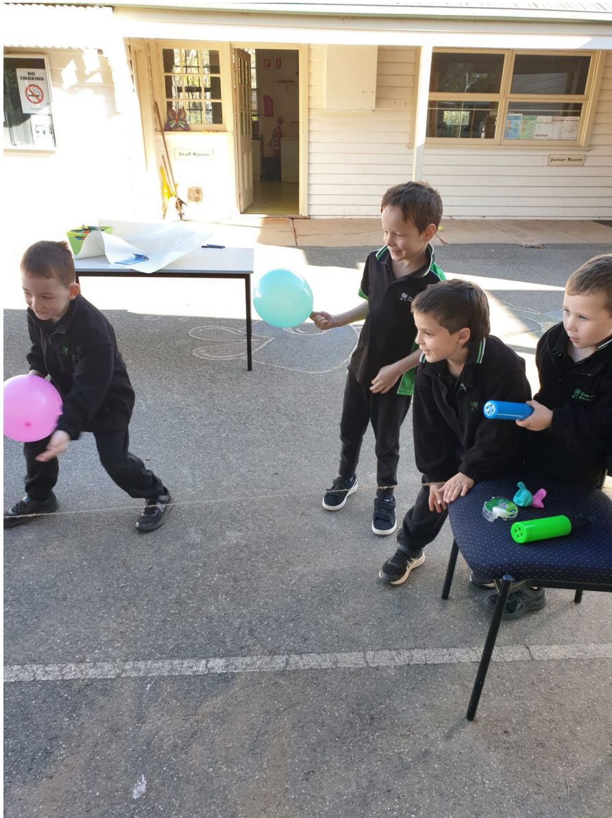
Figure 3. Great Western Primary students competing in the balloon rocket challenge. Who could get their balloon furthest along the string. The students enjoyed the competition and firing balloons along a string just seemed fun.