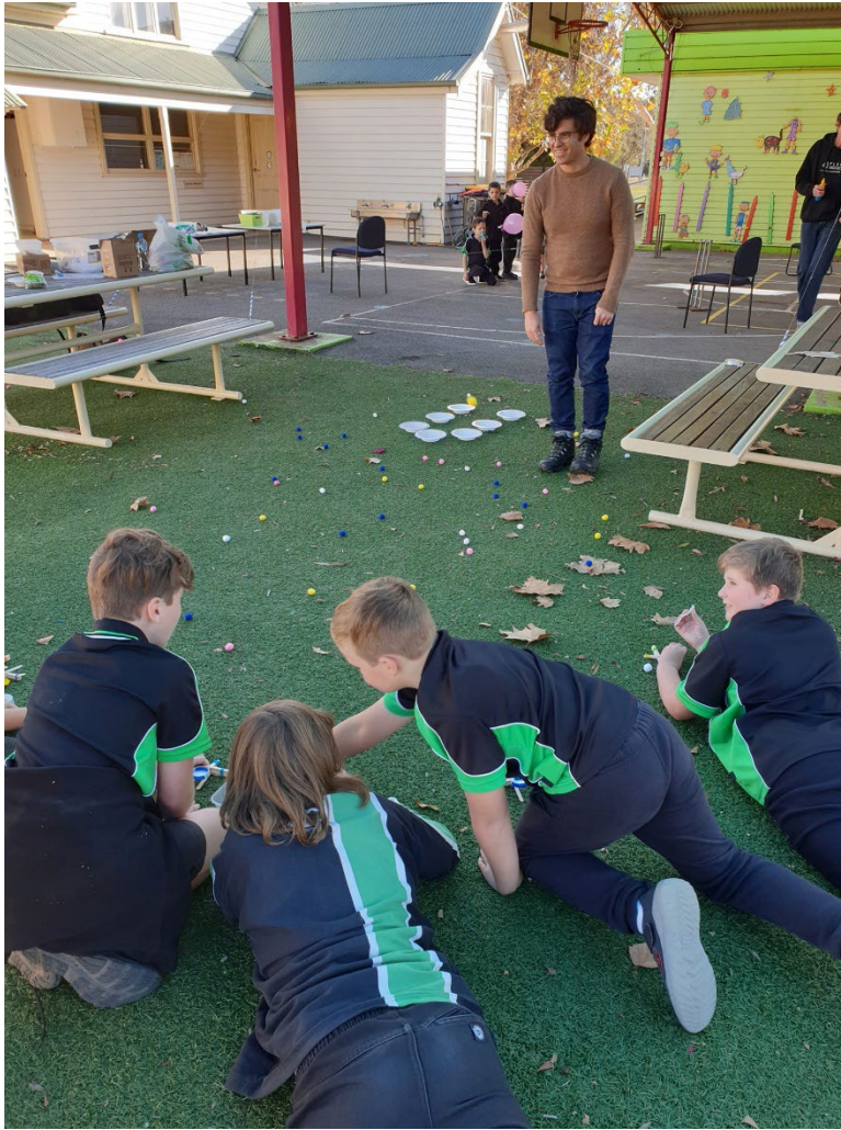
Figure4. Great Western Primary students rising to the challenge to test out their modified catapult to get as many projectiles into the targets (bowls) as possible. It is harder than it looks.