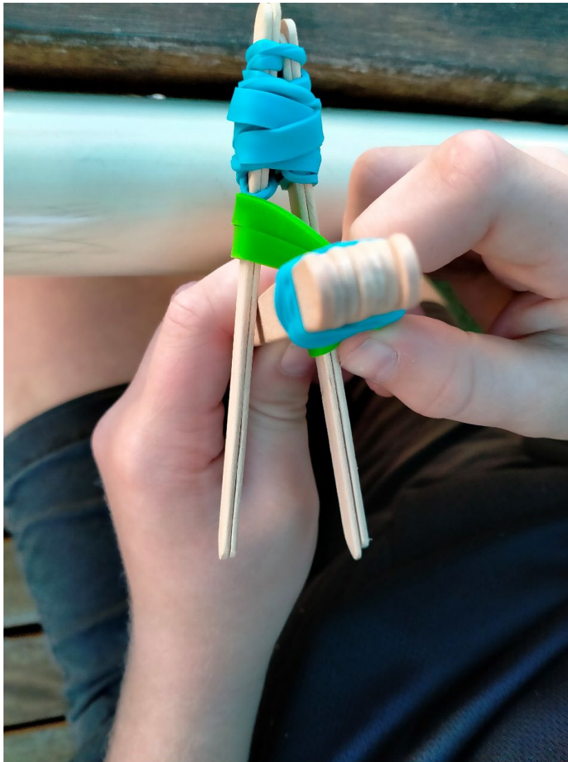
Figure 3. Great Western Primary student applying what they learned about potential elastic energy to increase the potential energy in the catapult lever (using two icy pole sticks), adding extra twists to the rubber band connecting the levers at the end and adding an additional rubber band closer to the fulcrum point. The aim for the rubber band modifications was to increase their elastic potential energy.

One parent commented to me (Jason Major) after the event that their child came home and talked about how he had loved the FLEET visit.